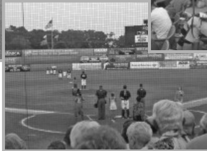
The Star Spangled Banner was never sung better than this Mountaire Singer.