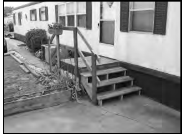
The Finished Project!