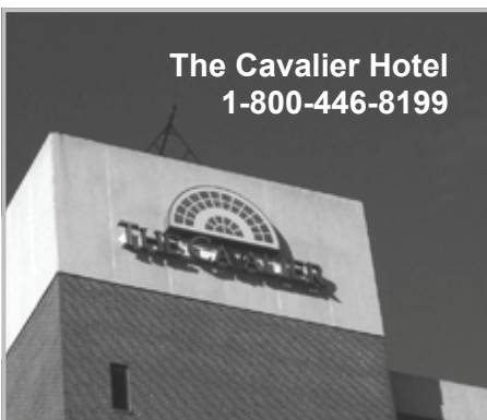
The Cavalier Hotel 1-800-446-8199