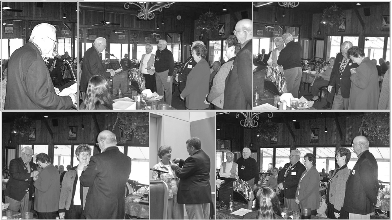
Finally... All the Candidates are now Pinned!