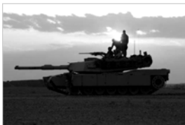
Watching Our Back