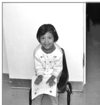
A Young Girl waiting for Eye Test