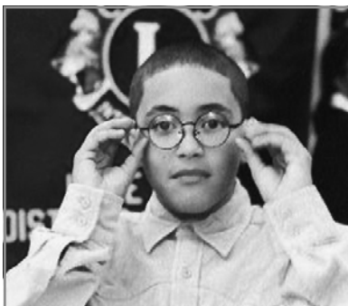
A young boy receives glasses courtesy of the LCIF SightFirst Program

It is anticipated that well over 1,000 children will be screened this Fall and many volunteer man-hours will be devoted to this essential and worthwhile community-based vision saving program.