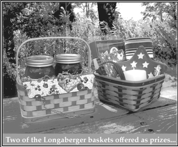
Two of the Longaberger baskets offered as prizes...