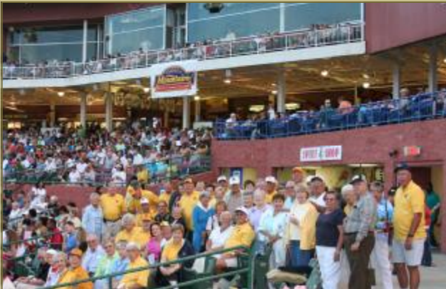
What a gang!!! Baseball and Fireworks... the way we like'm

Well... wasn't that a hot summer... by gore! Pun intended. Your Board has had a very busy summer this year and we expect all of our Club members have as well, in spite of the heat. So far, we have finished the Club schedule of Events, Committee assignments and made other important decisions but more importantly, we've even had time for some fun!