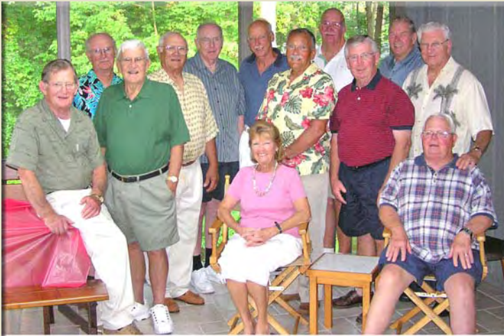
The "Dirty Dozen" gather...

The Environmental Services Group, better known as the can collectors or the "Dirty Dozen" met recently, along with their spouses, to celebrate another good year of can collecting and recycling... and the continued high price of aluminum.