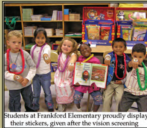
Students at Frankford Elementary proudly display their stickers, given after the vision screening

It should be noted that vision screening is a good beginning to proper eye care. A screening does not replace a professional examination, but it can help identify children at risk for eye disorders. Finding eye disorders in their early stages saves SIGHT!