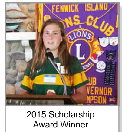
2015 Scholarship Award Winner

After lunch, the FILC Scholarship Winners in attendance were introduced and said a few words about their thanks & plans: