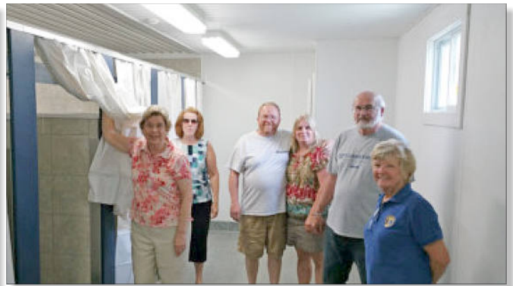
The Award Ceremony; The Summer Kids; & The Restoration Inspection Team!