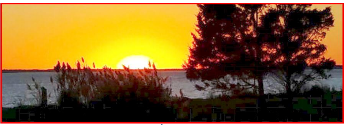
Indian River Marina October Sunset