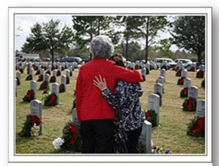
Remember the fallen who gave up their tomorrow with family and love ones, so that we can enjoy ours...

"To be killed in war is not the worst that can happen.