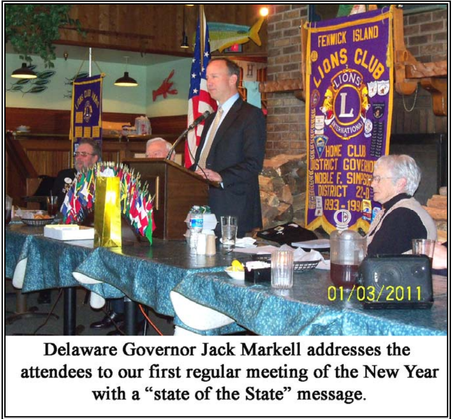
Delaware Governor Jack Markell addresses the attendees to our first regular meeting of the New Year with a “state of the State” message.

On January 3, we were honored to have Governor Jack Markell visit our Club. He addressed the state of the economy and said that Delaware is facing some tough budget decisions. He stated that we can't tax or spend our way to prosperity. He believes that education is important and reported that Delaware was one of the two states that received funds from the Federal Race to the Top Competition. Improving education can lead to job creation and opportunities for citizens of Delaware. He also said that the state is willing to pursue any suggestions of partnering with service organizations.