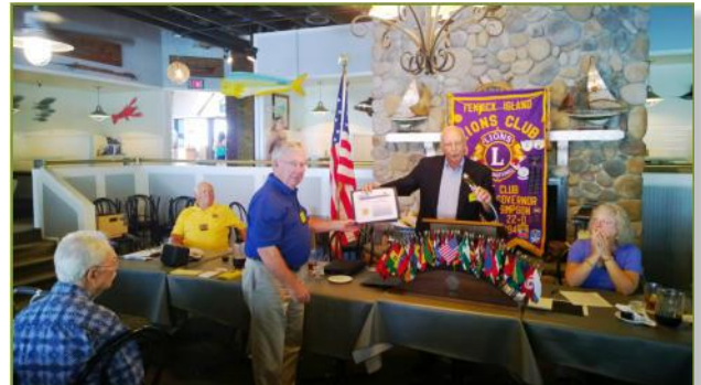
Only image with a "full Monty"!