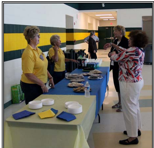
The "Hospitality Committee" confers before the LEO Club awards party.