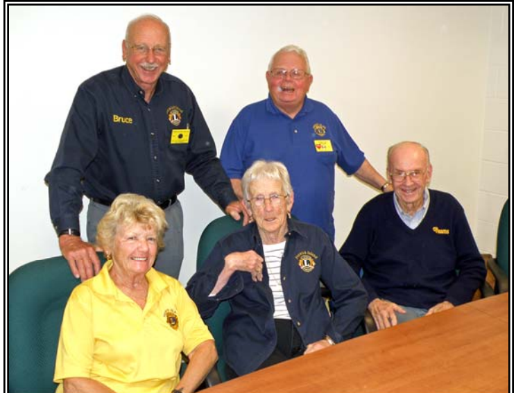
The Scholarship Committee, after completing interviews with twelve Indian River High School seniors. Smiles all around! See article beginning on page 4.

A shot gun approach was my next thought. Just list things in a random manner, but then something might have been missed. So that idea was shot down. The only way to tell you what an outstanding, caring, giving, friendly, truly dedicated to helping others, you (as members of the Fenwick Island Club) are is to tell you. (Cont'd next page.)