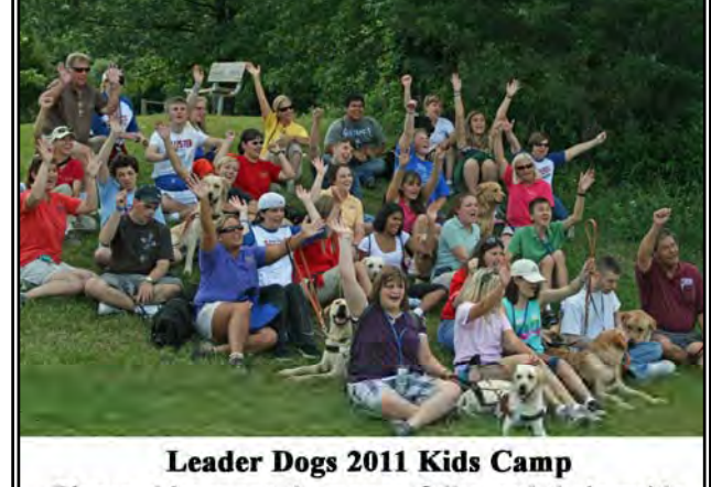
Leader Dogs 2011 Kids Camp Pictured here are the young folks and their guide dogs who attended the Leader Dogs summer program. Prior to receiving their dog, each client attends a 26-day residential training program to be paired with a guide dog. This is a life-changing event that opens the door to independence, safety and self-worth for many of the students.

Each year, over 270 students attend a 26-day residential training program to be paired with a guide dog. This is a life-changing event that opens the door to independence, safety and self-worth for many of students.