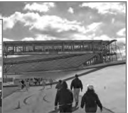
And so... the walks begin! Sure hope the walkers didn't catch "Over use Syndrome" walking on a slant during their event!

Raceway picture shows an estimated crowd of two hundred supporters ready to walk the "Monster Mile" and have some FUN!