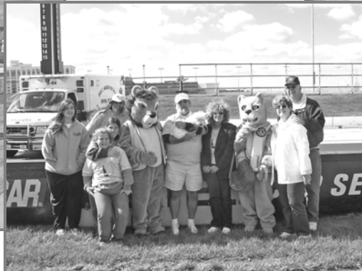
Our FILC gang with Leos