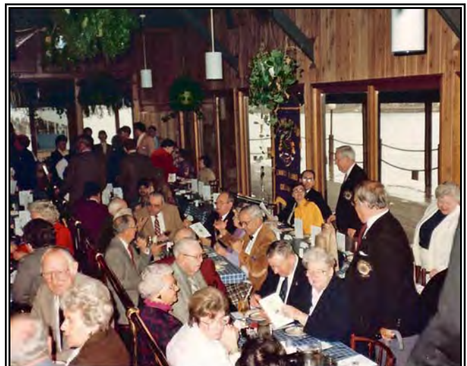
Part of the 200+ people on hand at Harpoon Hanna’s to celebrate the founding of the Fenwick Island Lions Club at its Charter Day ceremony in January 1987.